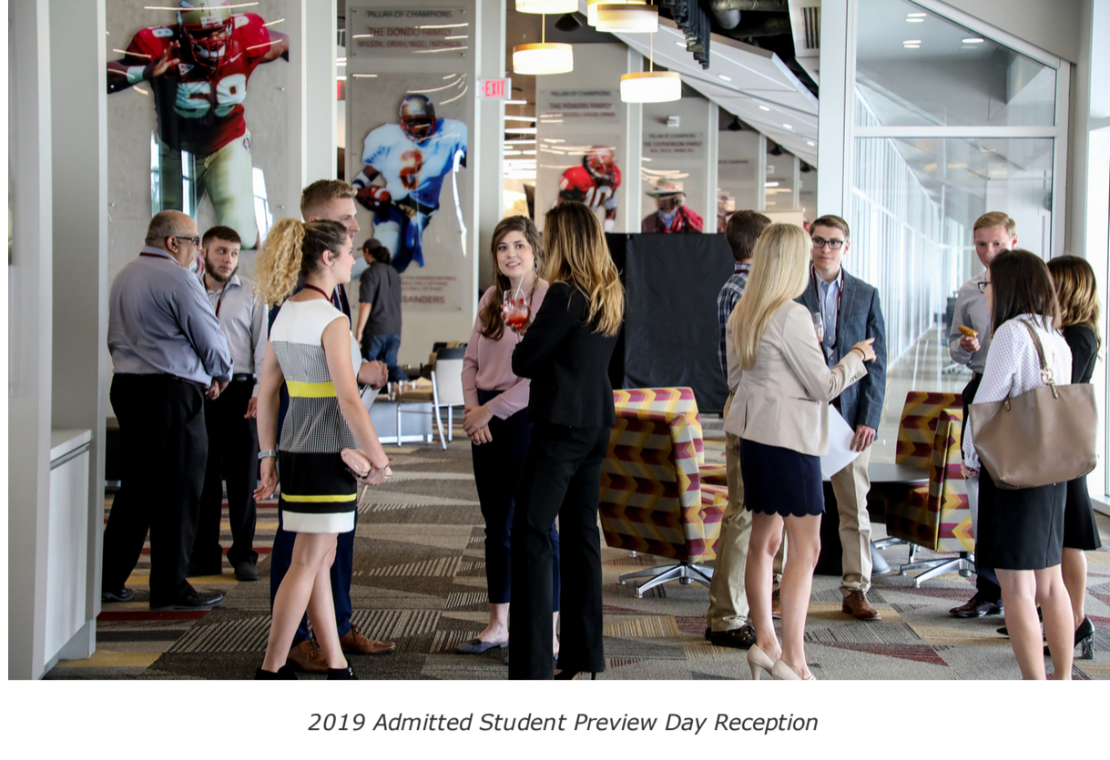
2019 Admitted Student Preview Day Reception

The College of Law is inviting all alumni to help us recruit the next class of 1Ls during an Admitted Student Preview Day Reception on Thursday, March 31, from 5-7 p.m. The event, which will be held at the Dunlap Champions Club in Tallahassee, is an opportunity for alumni to speak with admitted students about their experiences in law school, how they continue to engage with law students, the atmosphere and opportunities at FSU Law, and the advantages of attending law school in Florida's capital city. It is critical to the mission of the law school to have alumni connect with prospective and current students, both of whom will be at the event. We know from experience that alumni engagement with prospective students has a positive impact on their decisions to attend FSU Law. Alumni who would like to attend the Admitted Student Preview Day Reception should RSVP online by March 21 .