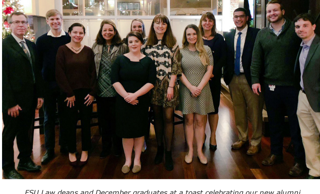
FSU Law deans and December graduates at a toast celebrating our new alumni