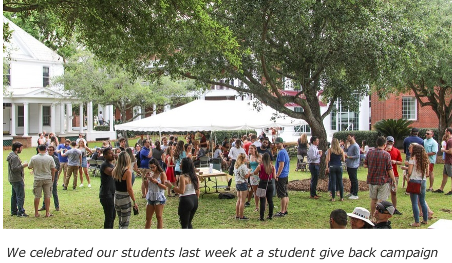
We celebrated our students last week at a student give back campaign appreciation event.

Our annual student give back campaign concluded in March and we are pleased to report that collectively, our students donated more than 1,100 hours of their time and more than $3,500 to advance the College of Law! An incredible 88.27% of students donated either time or finances, with many doing both. Our 1Ls ended the campaign with the highest rate of participation – an impressive 91.51%! We are very grateful to our students for their support, which communicates a great deal about our FSU Law community. Last week, we held an appreciation event at the law school to thank students for their generosity. The event was also a nice opportunity to connect with students before exams begin next week. Many thanks to everyone who helped us celebrate our vibrant, supportive student body!