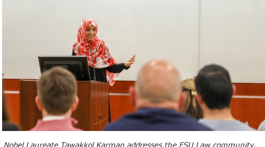
Nobel Laureate Tawakkol Karman addresses the FSU Law community.

Earlier this month, we were honored to host Nobel Laureate Tawakkol Karman for a special reception. Karman is a journalist, politician, human rights activist and mother of three who founded Women Journalists Without Chains in order to promote freedom of expression and democratic rights. She later helped spark the Yemeni uprising during the Arab Spring uprisings and in 2011 shared the Nobel Peace Prize for her work in the areas of peace and women's rights, becoming the first Yemeni, the first Arab woman and the second Muslim woman to win a Nobel Prize. Karman has tirelessly advocated for women's rights to full participation in peace-building work, as well as human rights and access to education. Having her speak to students about her inspiring work and answer their questions was an amazing opportunity!