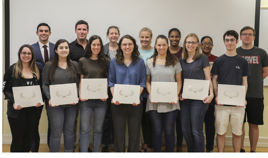
Students were honored in April at a reception for legal research certificate recipients.

In April, we recognized students who earned legal research certificates during the academic year through our Research Center. The certificates are awarded to students who attend research workshops presented by our research librarians. Workshops allow students to hone their research skills and make themselves more marketable to employers. Librarians design the workshops with input from practicing attorneys to ensure that the skills students learn are applicable to current law practice. Students report that the workshops are very beneficial when searching for jobs and clerking/interning during law school. This year, two first-year students earned Gold Certificates after attending all 20 legal research workshops offered during the year. In addition, 25 students earned the Practice-Ready Research Certificate, attending six or more workshops focused on practical legal research. Seven students earned certificates in Advanced Searching and nine earned the certificate in Florida Research.