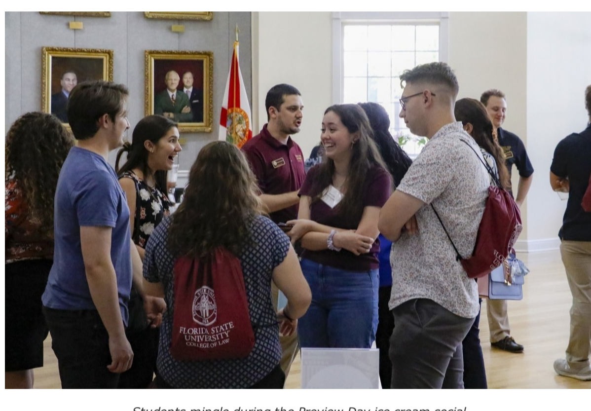
Students mingle during the Preview Day ice cream social.