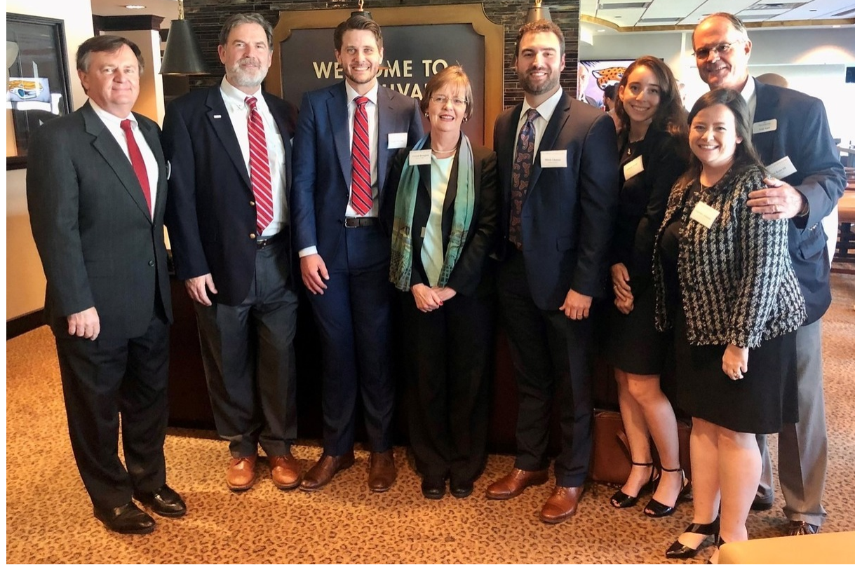
Alumni at the May 11 Jacksonville reception